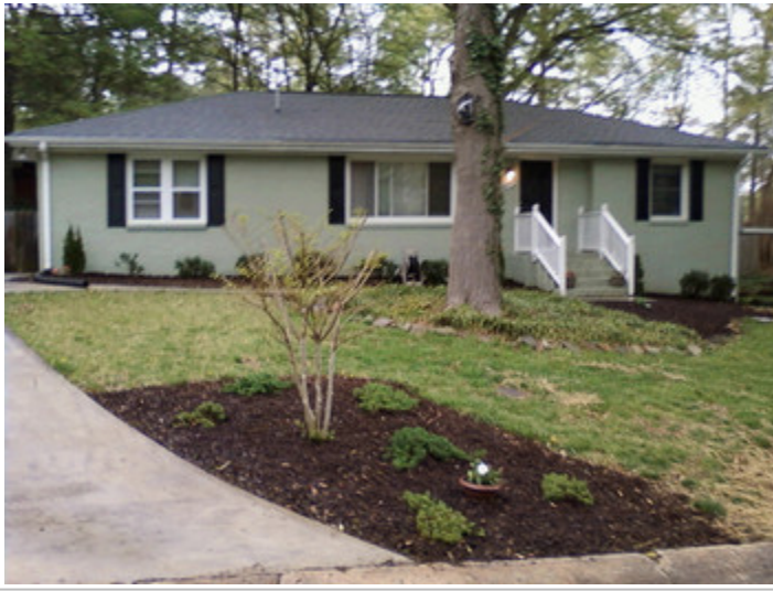
4-SIDED BRICK BEAUTY