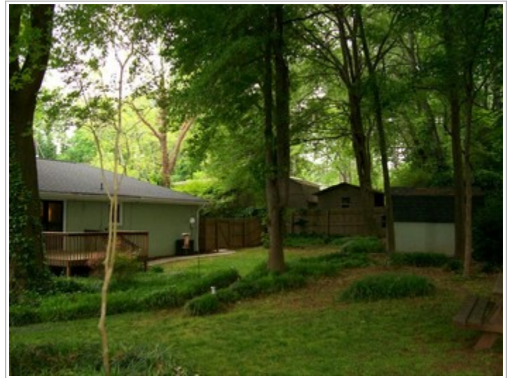
Yard has trees that provides Shade