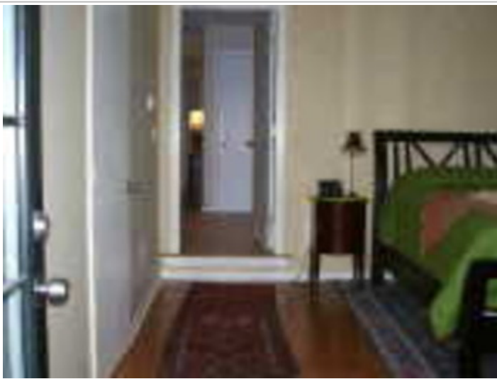
ANOTHER VIEW OF MASTER BR