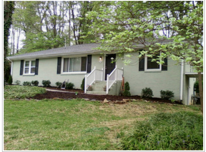
A SIDE VIEW