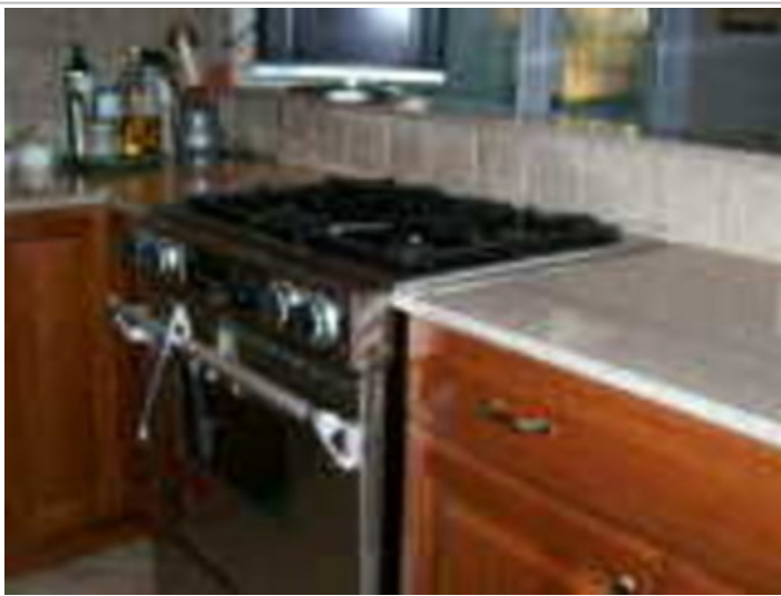
GAS JENN AIR/CONVECTION OVEN