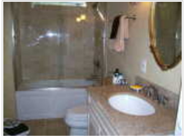
ELEGANT MASTER BATH