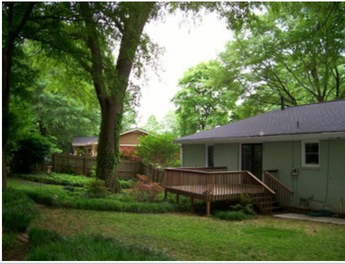
Deck and Fenced Yard w/Double Gate