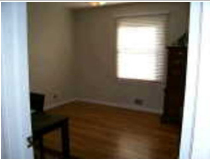
LITE & BRITE OFFICE