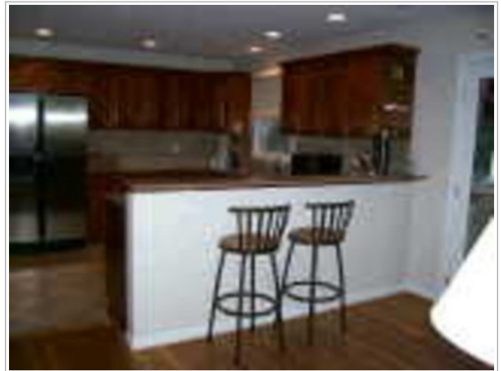
STONE C./TOPS & BREAKFAST BAR