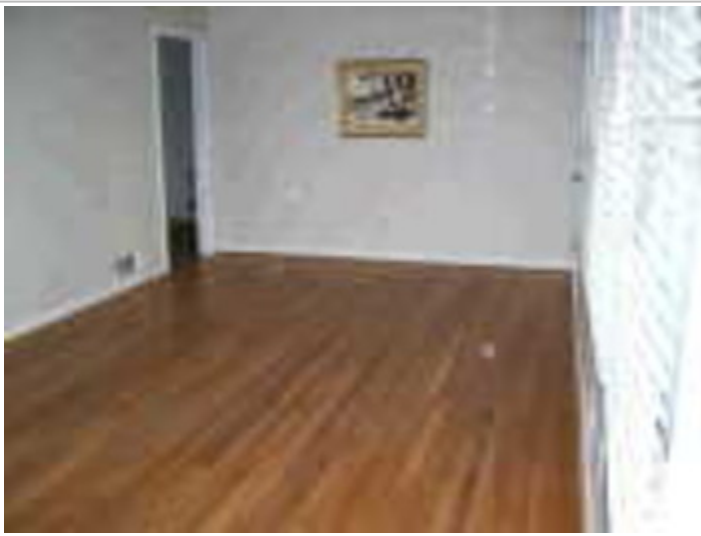
HARDWOOD FLOORS/LIVING ROOM