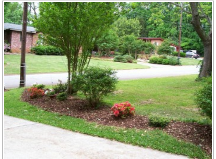
Front Side Yard Blooming, too!