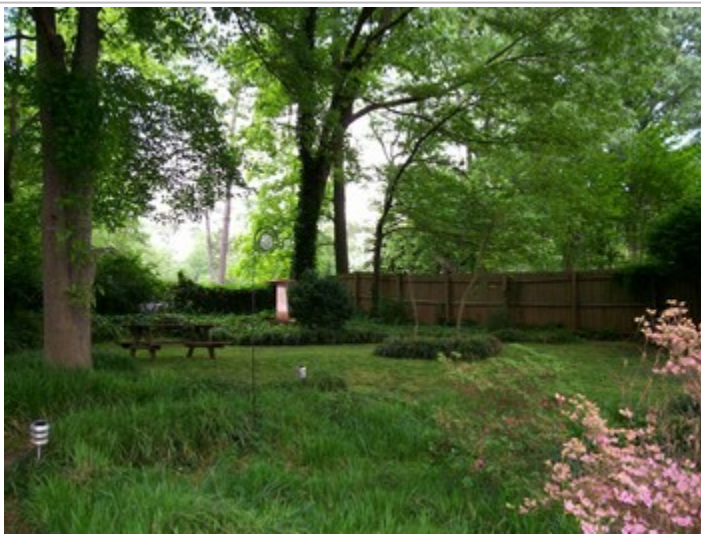
Well maintained landscaping front and back...