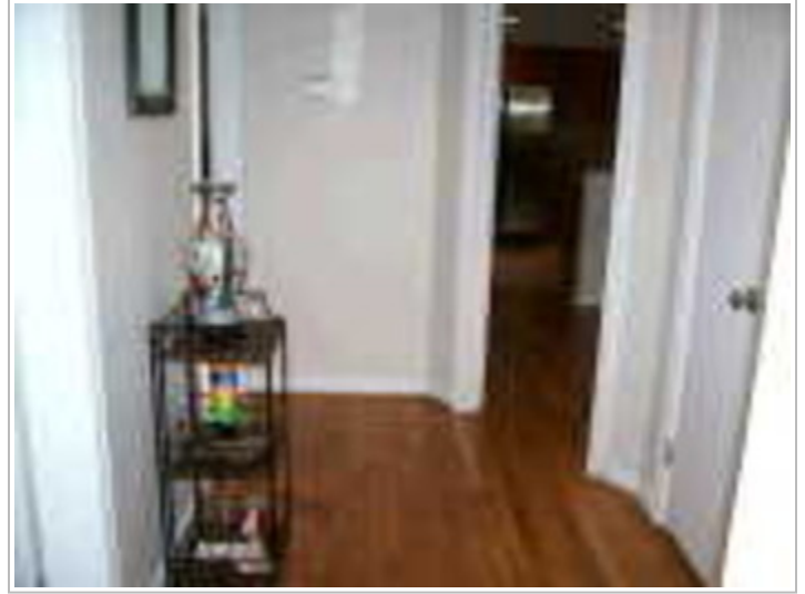
HALL TO BEDROOMS