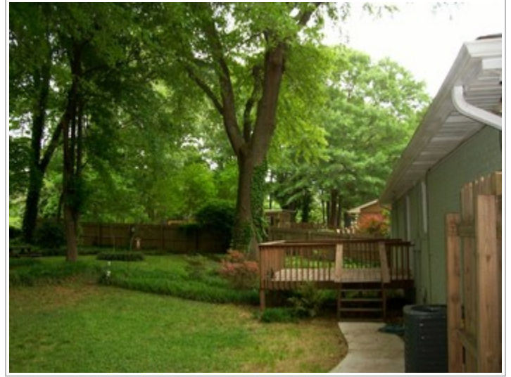
View of walkway & Deck Entry